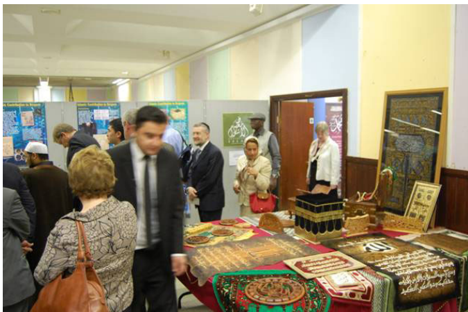
Visitors were given the opportunity to browse through the exhibits