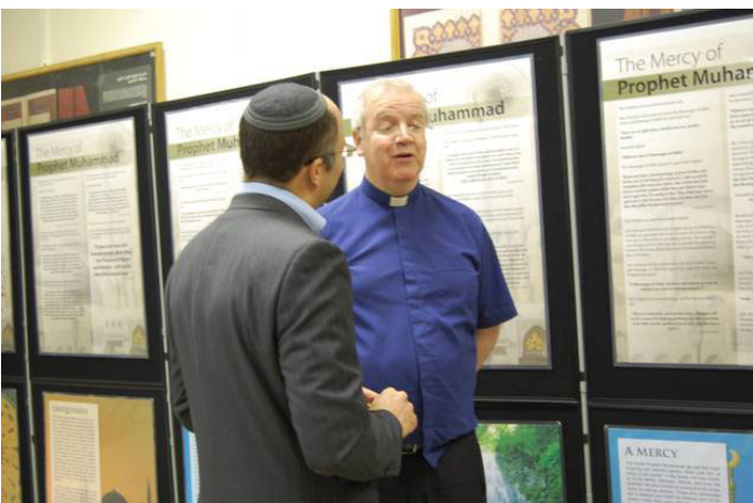
There was ample opportunity for people of different faiths to discuss aspects of their faiths whilst looking through the posters.