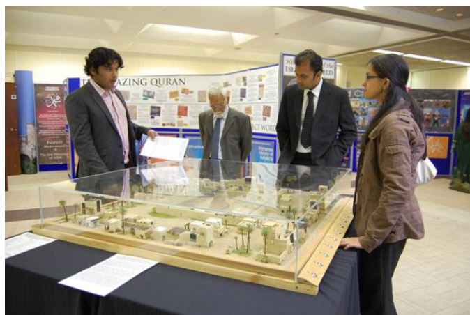
As well as an interactive model of Madina encompassing the prophet's mosque and neighbouring houses.