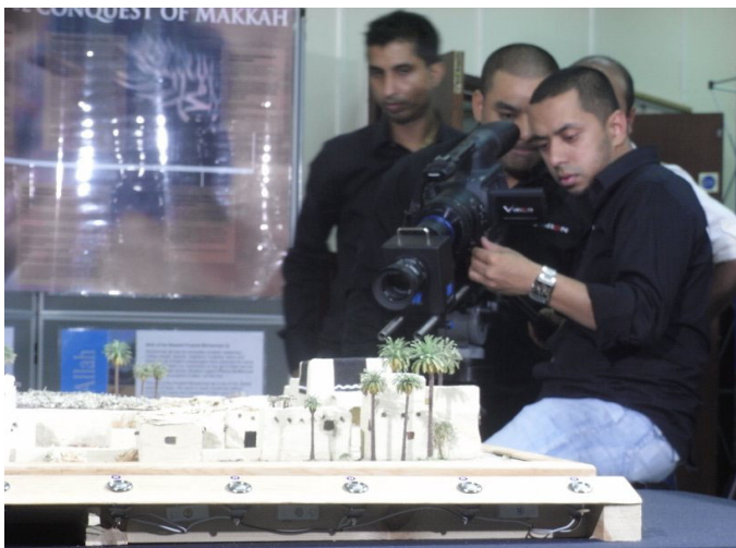
The media and professional filming crew enjoyed taking shots from many angles.