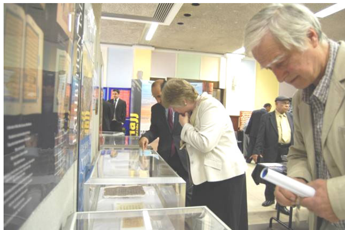
On display were Qur'an manuscripts from different eras and regions of the world.