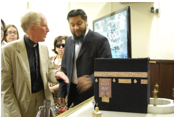
In addition to posters, there were also models of the Ka'aba in Makkah, with a cut out section allowing visitors to see the inside...