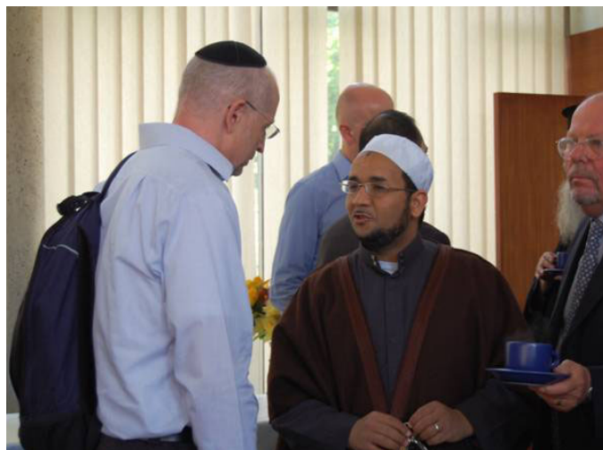
The Imam of London Central Mosque was also available to interact with guests and answer queries.