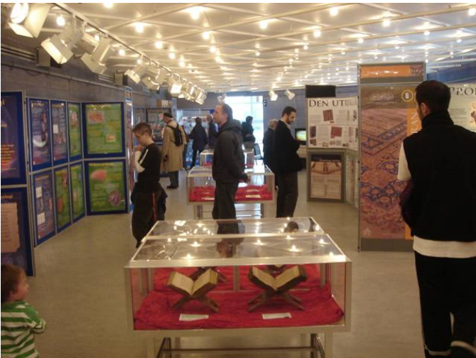
Followed by Astronomy, Embryology and Biology in the Qur'an...