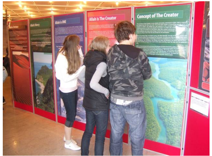
...Following through to the Islamic understanding of Creation and the attributes of the Creator...