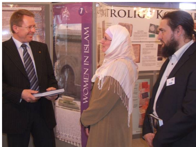
The opening was attended by the Deputy Governor of Tromsø ...