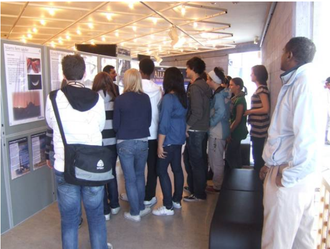
The introduction area with the Islamic Belief and the Five Pillars in Norwegian...