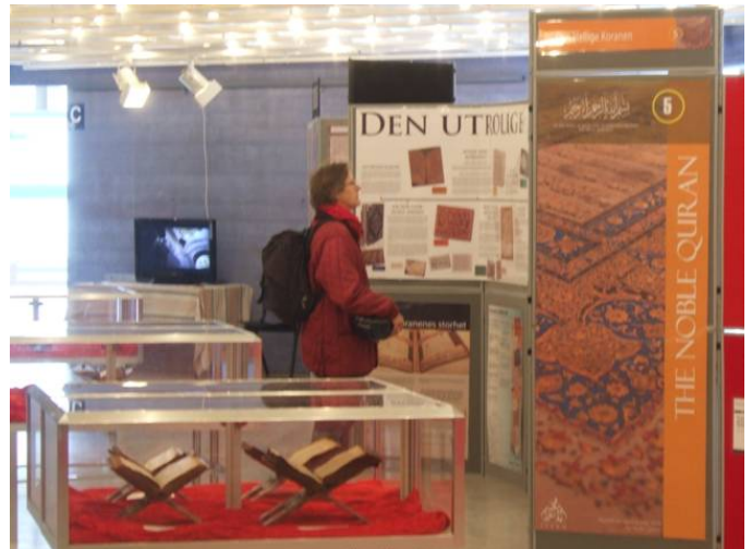
The Amazing Qur'an poster was opposite the Islamic contribution to Civilisation...