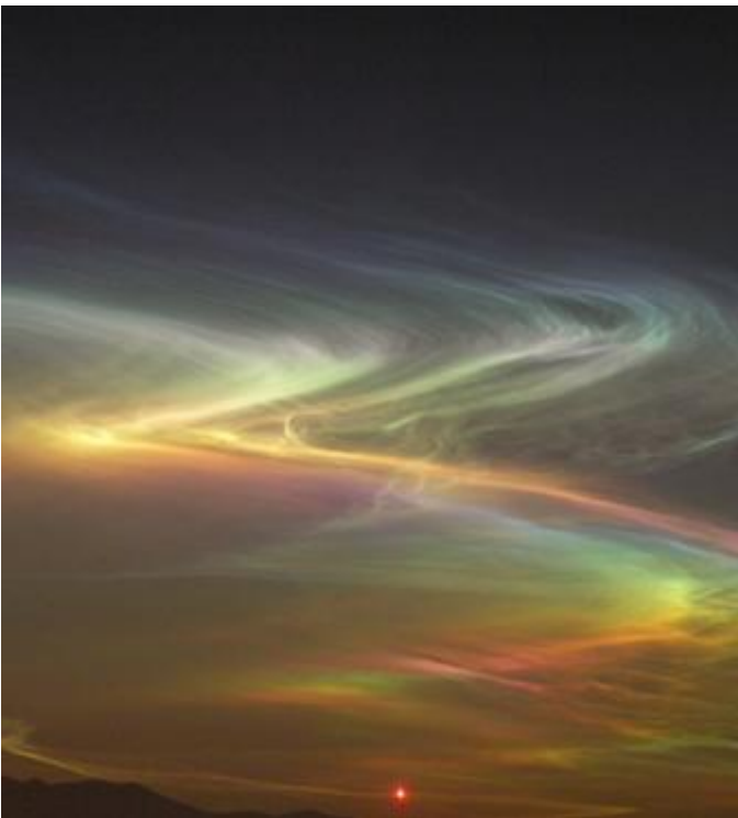
The Northern Lights. Tromsø is situated right in the centre of the Northern Lights zone.