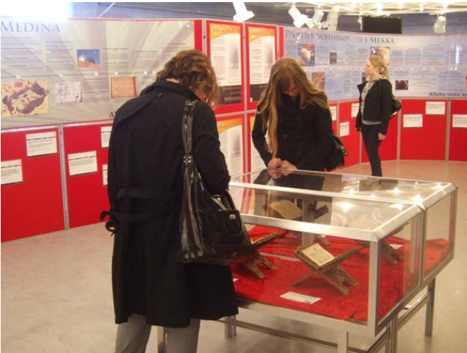
The next area contained cabinets with ancient gold coins and other rare artefacts...