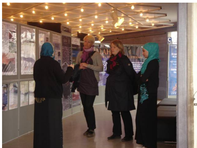
Tours were conducted every hour or every 30 minutes during peak periods by the EI Team...