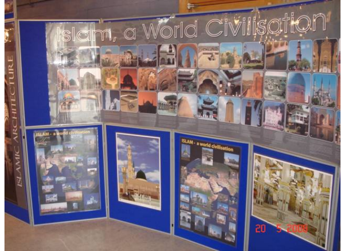
Culminating in the world civilisation of Islam and Islamic Architecture. Many tours would then visit the Alnor Center which was a few hundred yards away.