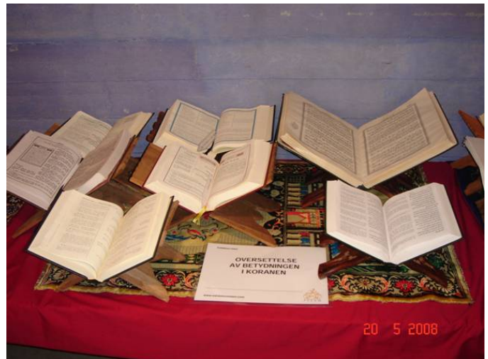
... And a selection of translations of the Qur'an in a variety of languages including Norwegian and Braille...