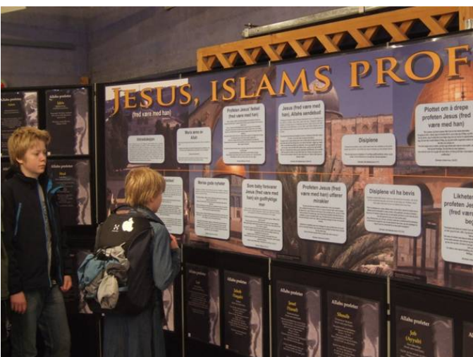
...Leading to the section of the Prophets including Jesus (as) and the Call of the Prophets (as).