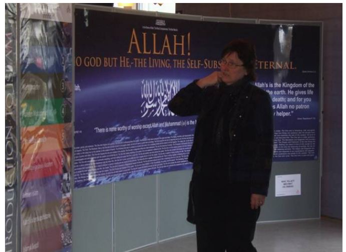
The entrance to the Exhibition area with a Welcome sign in Norwegian and a poster expounding the names and Attributes of Allah...