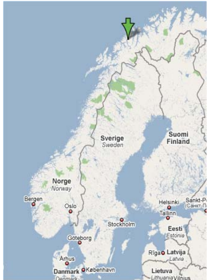
A map of Norway with an arrow pointing to the location of Tromsø.

Almost all of the posters, labels and signage was in Norwegian and plenty of supplementary information was also available as well as activity packs for children.