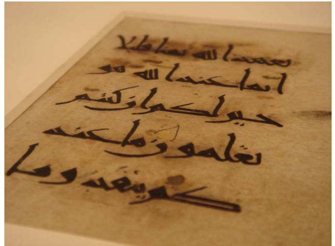
...And complete Qur'an manuscripts and various leaves including early first century parchments...