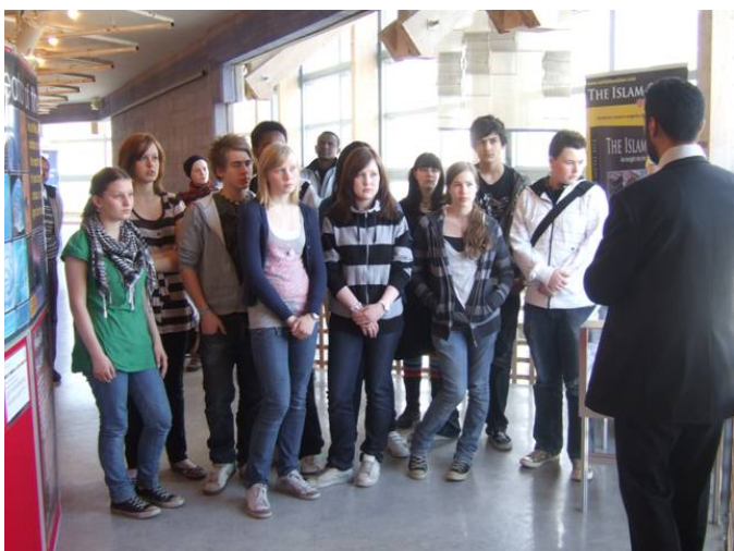
There were over twenty tours for school children with some deep and thorough discussions...