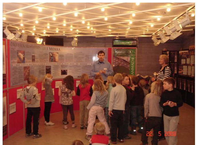
The next section was on the life of the Prophet Muhammed (saw) through Mecca and Madina ...