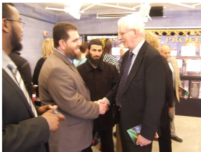
A delegation from Sweden's Ar-Risala foundation also attended the opening...