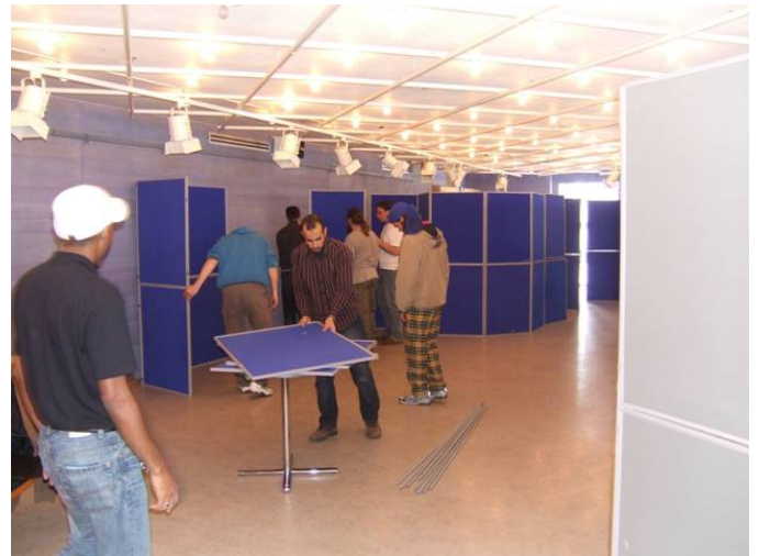
The Exhibition Islam team along with representatives from Alnor Center began the setup according to the above plan.