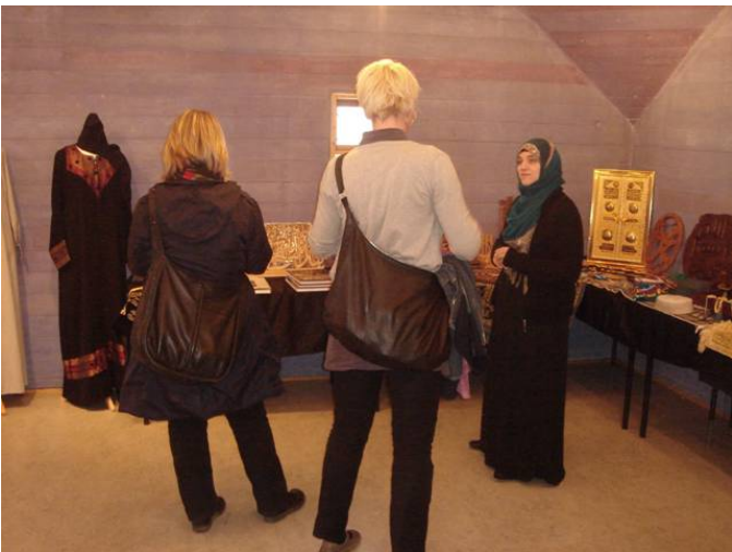
The next area contained mannequins displaying Islamic clothing and artwork...