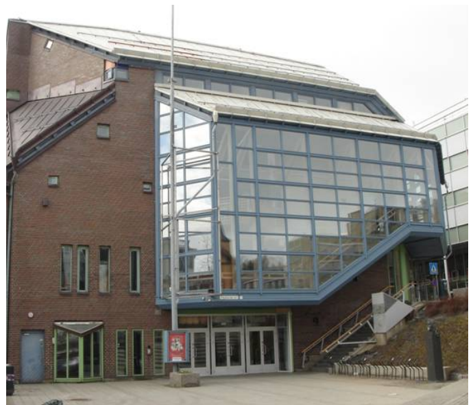
The Kulturhuset which hosted Exhibition Islam from Tuesday 20 th May to Tuesday 27 th May 2008.

A ground floor area was dedicated for the reception of visitors and for the distribution and sale of literature.