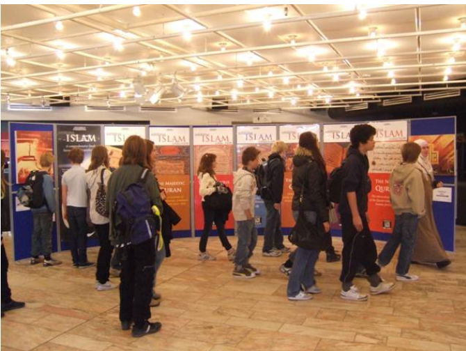
The entrance foyer of the Kulturhuset. The same area also contained literature and a welcome desk.