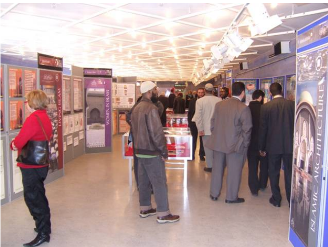
...Closely followed by Women in Islam and the systems of Islam, both of which raised great interest and discussion...