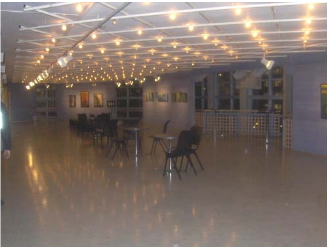
The exhibition area before setup...

The layout design for Tromsø, Norway, May 2008.